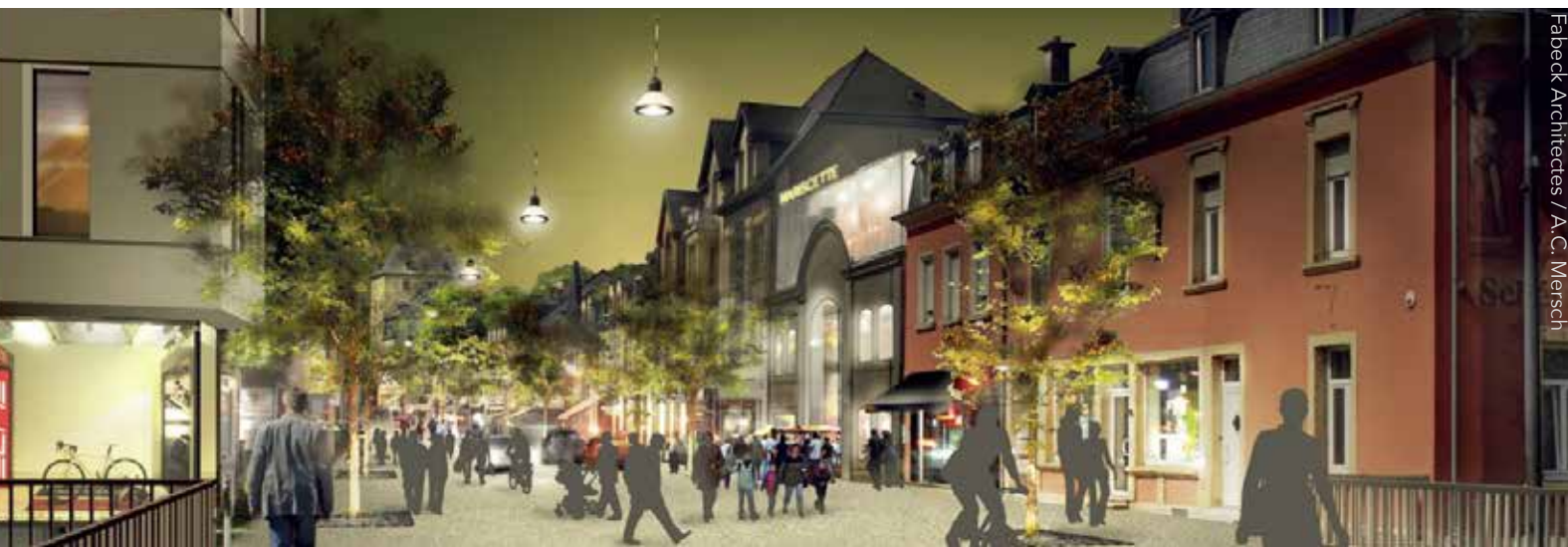
Fabeck Architectes / A.C. Mersch

The adjustment of the municipal business tax to the level of the capital and its neighbouring municipalities should continue to make Mersch attractive for medium-sized businesses and thus secure existing jobs in Mersch and create more. Businesses in Mersch must not be at a locational disadvantage.